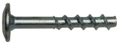
MCS-PG Concrete Screw with large pan head