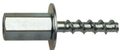
MCS-PG Concrete Screw with large pan head